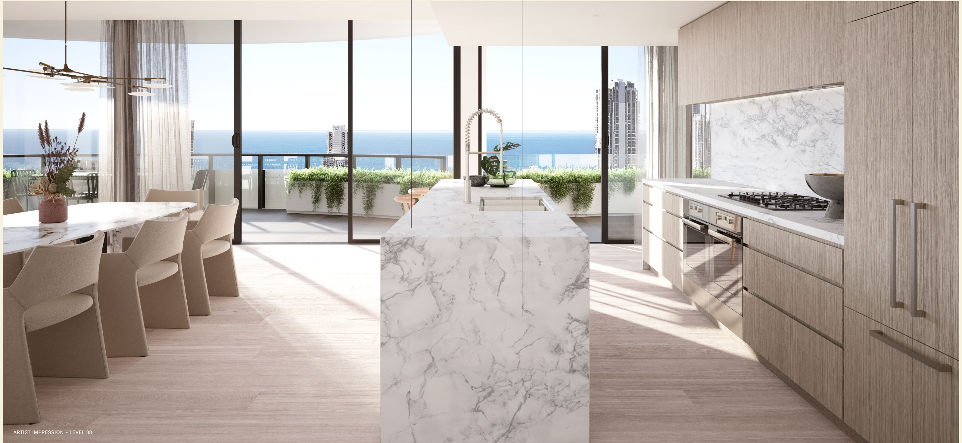
ARTIST IMPRESSION - LEVEL 38

Kitchens bathed in light, and designed to maximise space to entertain.