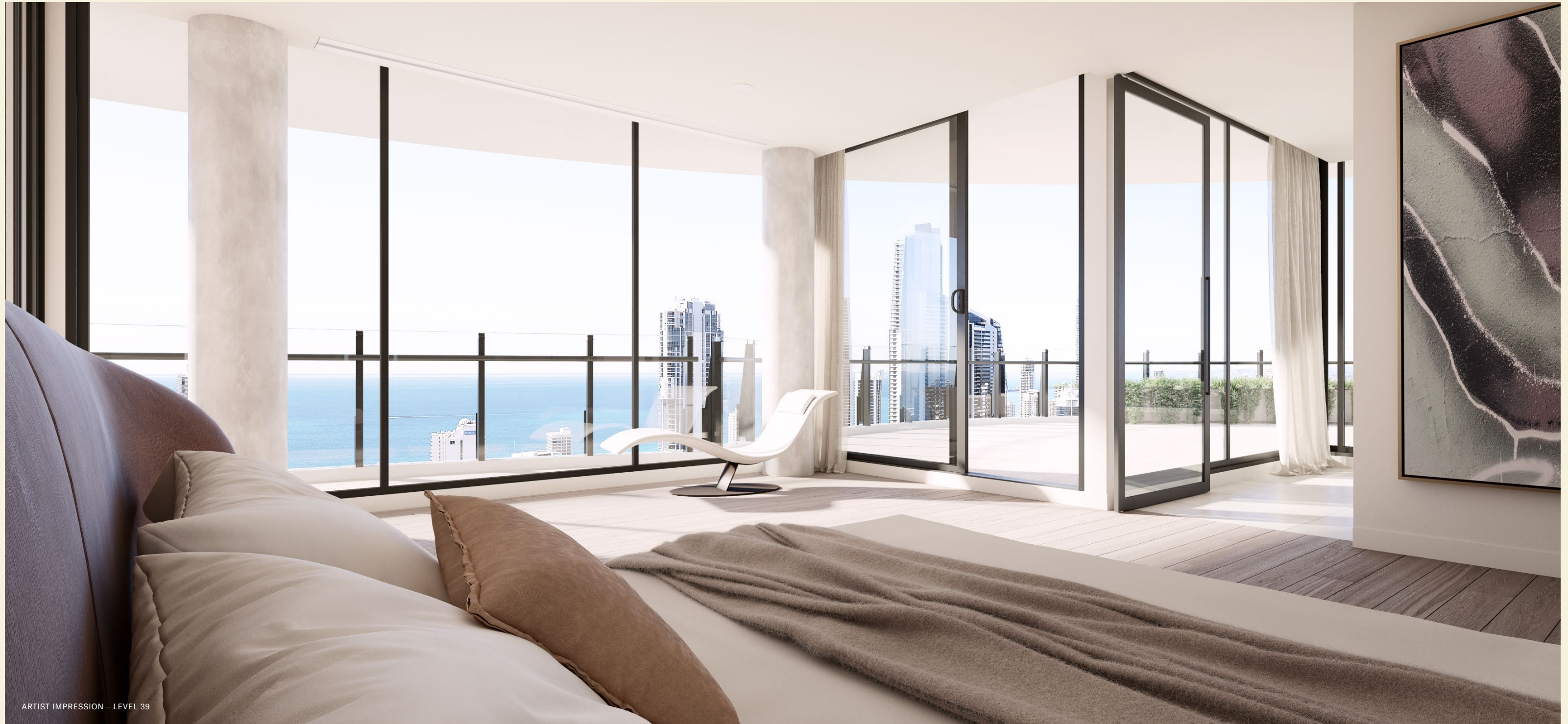
ARTIST IMPRESSION - LEVEL 39

Wake to views over Surfers Paradise with large spacious bedrooms boasting generous WIRs and en-suites, opening out onto sweeping balconies framed by views of the Surfers Paradise skyline.