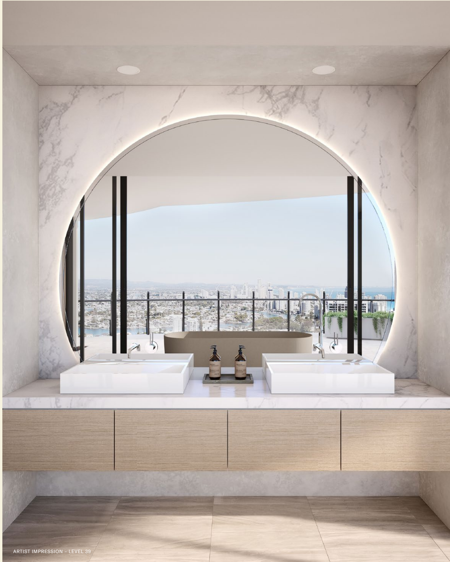
ARTIST IMPRESSION - LEVEL 39