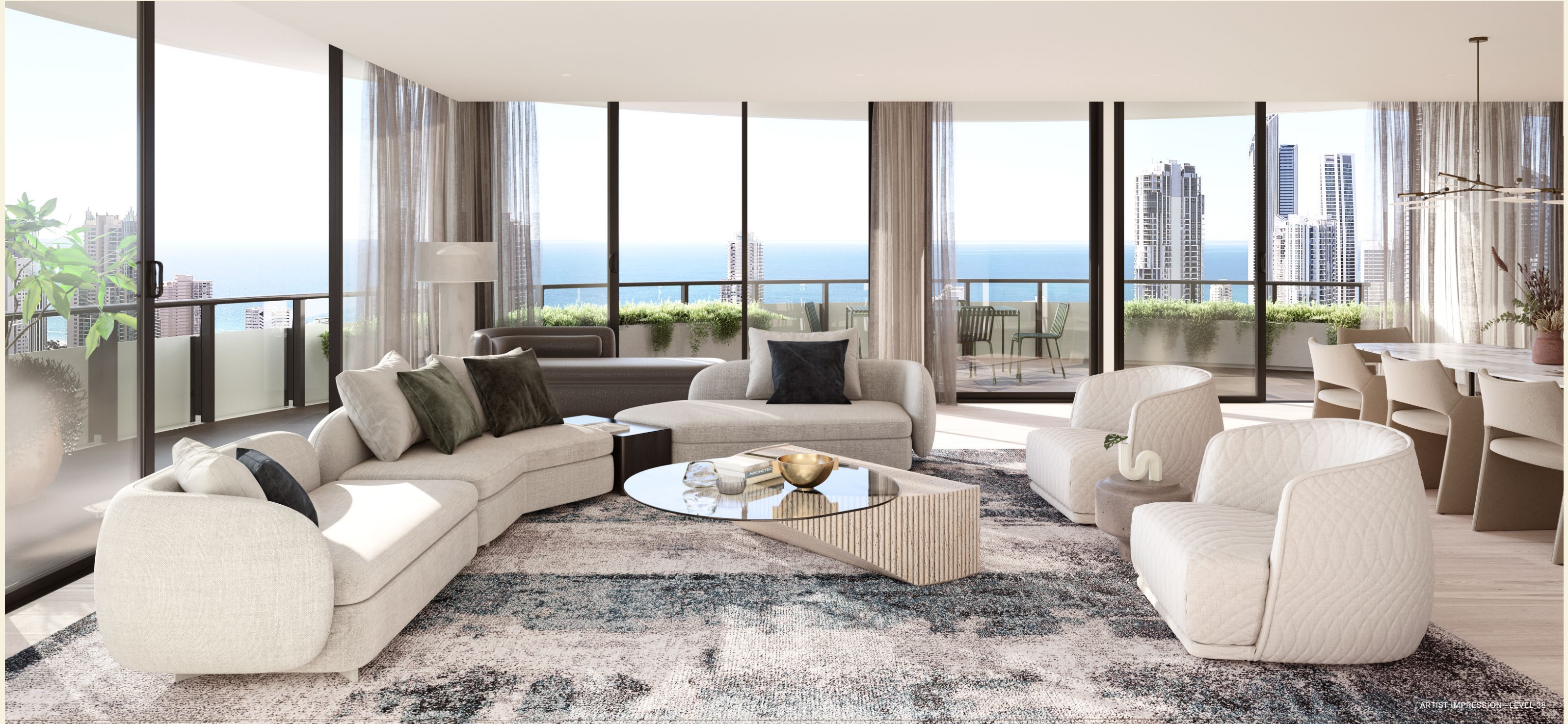
ARTIST IMPRESSION - LEVEL 38

Lavish spaces designed to be bathed in natural light, creates ideal settings to entertain and get the drinks flowing or wind down and recharge.