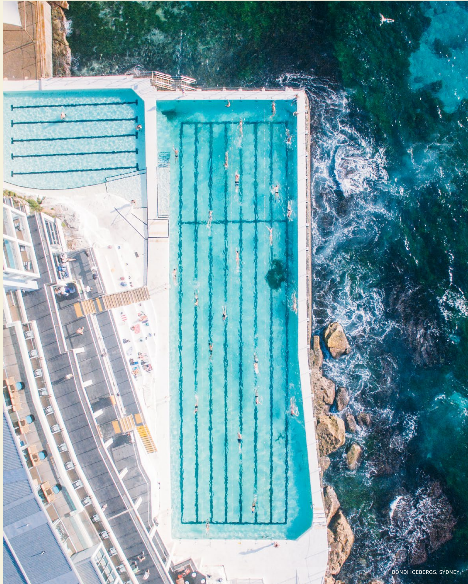
BONDI ICEBERGS, SYDNEY