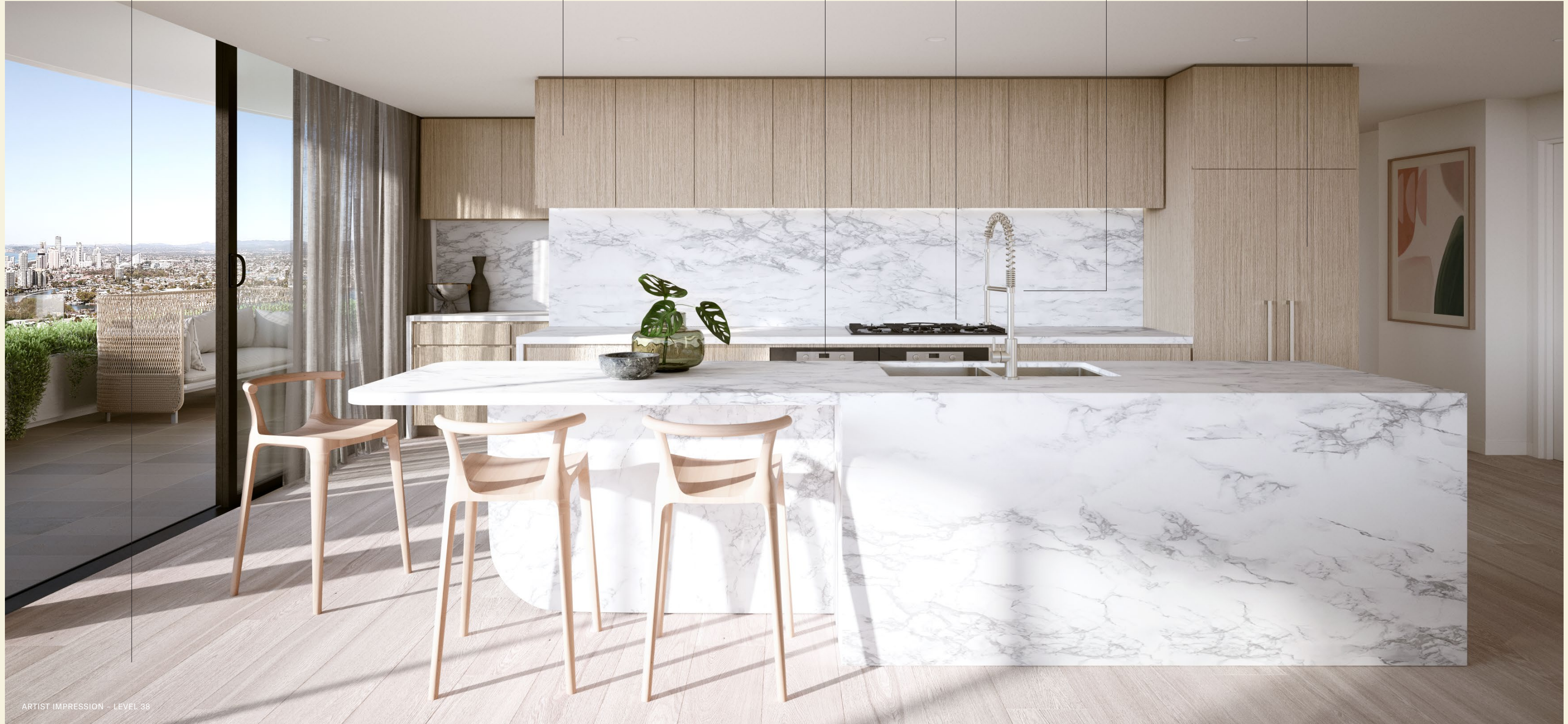
ARTIST IMPRESSION - LEVEL 38

Fisher & Paykel fully integrated French door fridge freezer