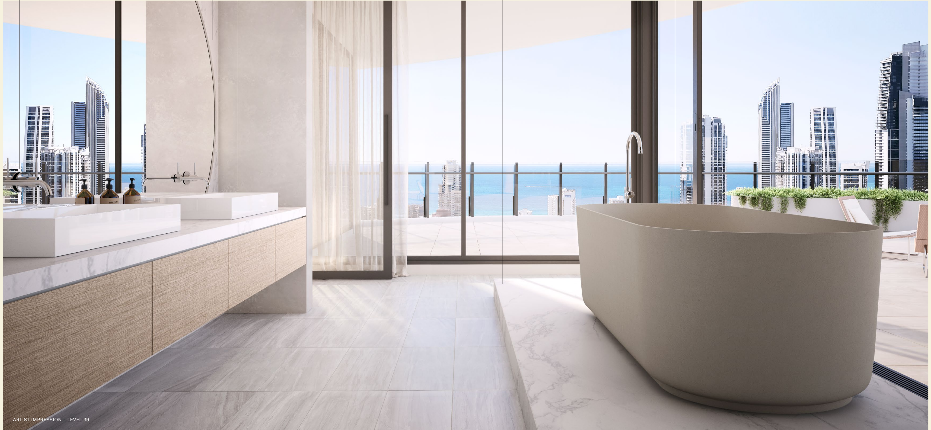
ARTIST IMPRESSION - LEVEL 39