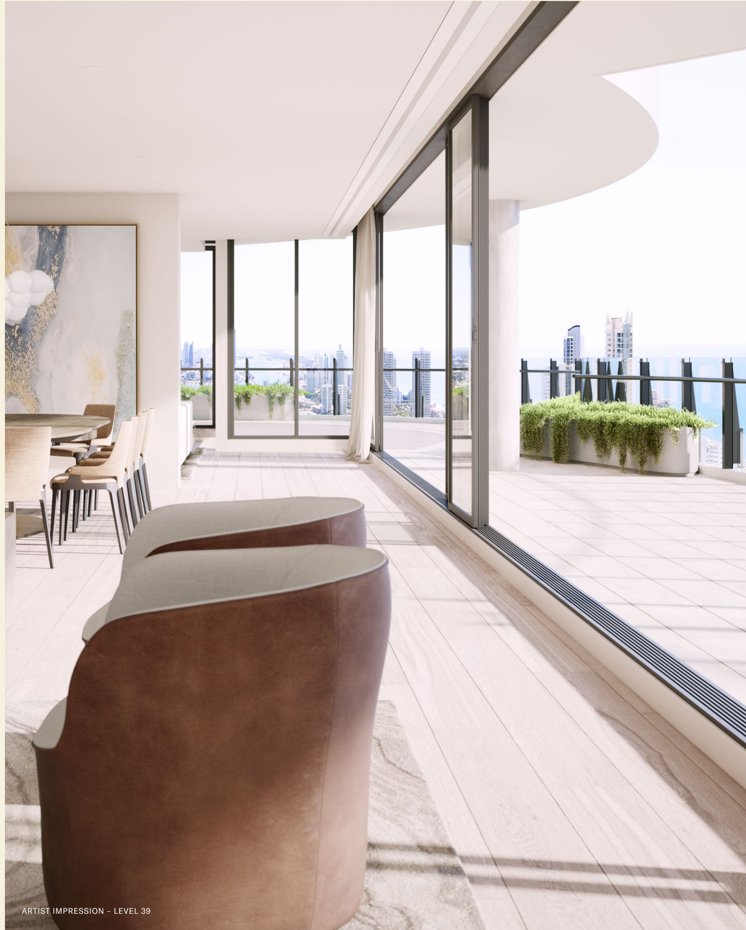
ARTIST IMPRESSION - LEVEL 39