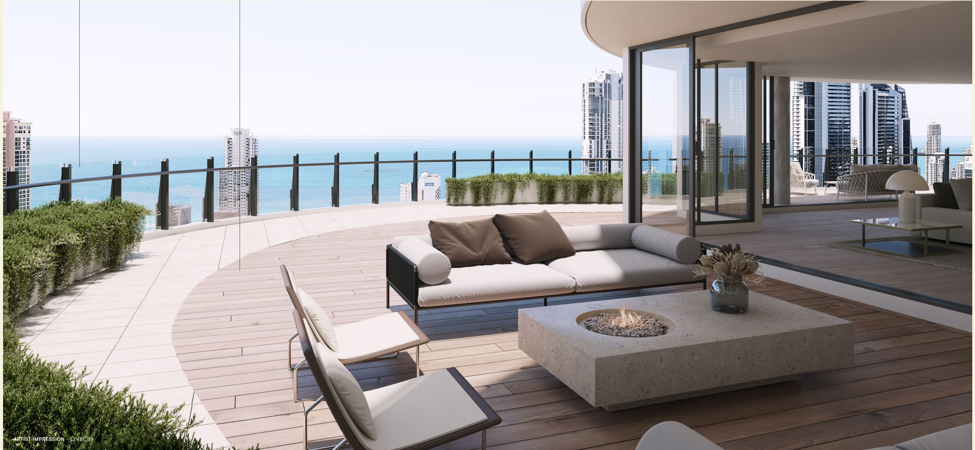
ARTIST IMPRESSION - LEVEL 39

Enjoy indoor/outdoor integration for an al fresco lifestyle all year round